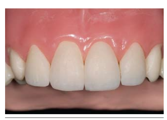
Figure 20: The widths of the newly fabricated restorations were assessed in three areas—gingival, middle, and incisal—to ensure harmony and balance.