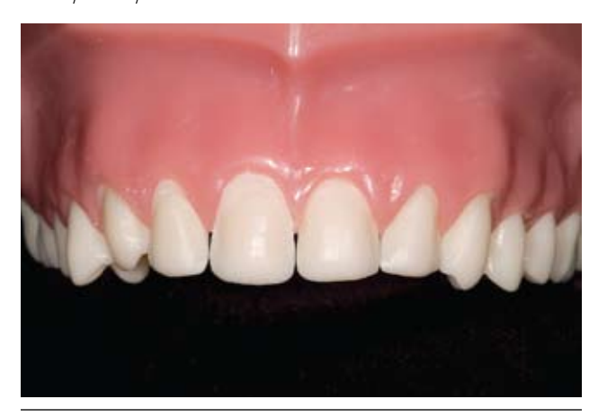
Figure 3: Facial view of teeth ##6-11, demonstrating an aggressive preparation on a typodont.