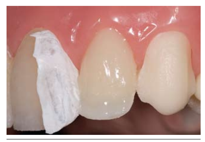
Figure 18: A mixture of Vital blue 30% and 70% clear tints was applied to the incisal zone of tooth #10.