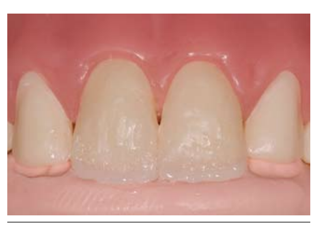
Figure 10: The remaining lingual contour and incisal plane was recreated by applying Opaque Snow composite, with the matrix as a guide.