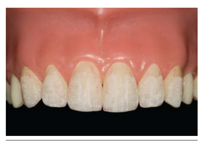
Figure 29: Faint red lines scribed on the composite outline the transition line angles. Texture can be carried to and beyond the line angles to simulate nature.