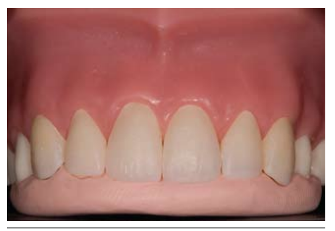
Figure 27: Since the PVS matrix was used for development of the incisal edges, note that a true fit was confirmed during assessment of the restorations.