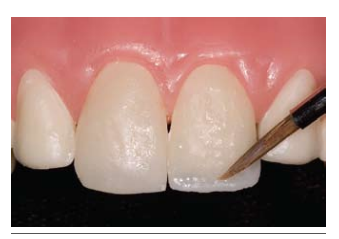
Figure 12: A mixture of Vital blue 30% and 70% clear tints was applied to the incisal zone to establish the appropriate incisal translucency.