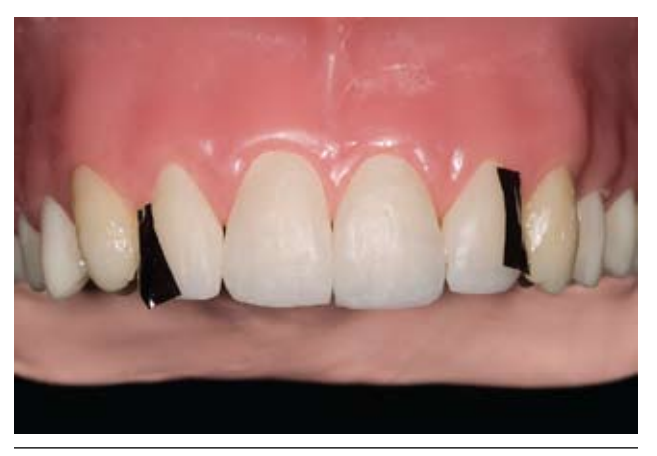
Figure 22: A second dentin replacement layer (body shade A1) was placed in the middle half of teeth #6 and #11 and extended to begin dentinal lobe development.