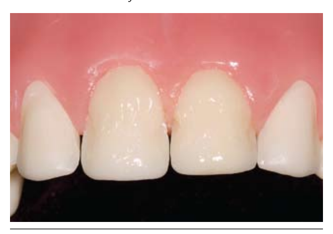
Figure 8: The initial dentin replacement layer (shade A1) was placed in the gingival half of the central incisors and extended partially into the incisal half.

dent Products; South Jordan, UT) in the gingival half of the tooth, almost to full contour. Extend this composite layer partially into the incisal half and light-cure as directed by the manufacturer (Fig 8).