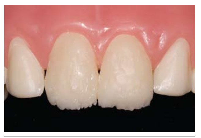
Figure 9: A second dentin replacement layer in shade B1 was placed in the middle half of the central incisors and extended to begin dentinal lobe development.