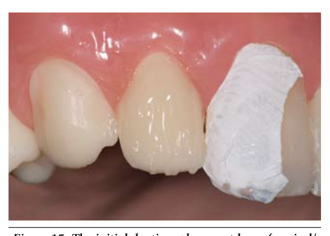
Figure 15: The initial dentin replacement layer (cervical/body A1 composite) was applied to teeth #7 and #10 in the gingival half almost to full contour.