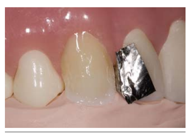
Figure 23: The remaining lingual contour and incisal plane was recreated by applying Incisal Edge Opaque Snow composite to teeth #6 and #11.