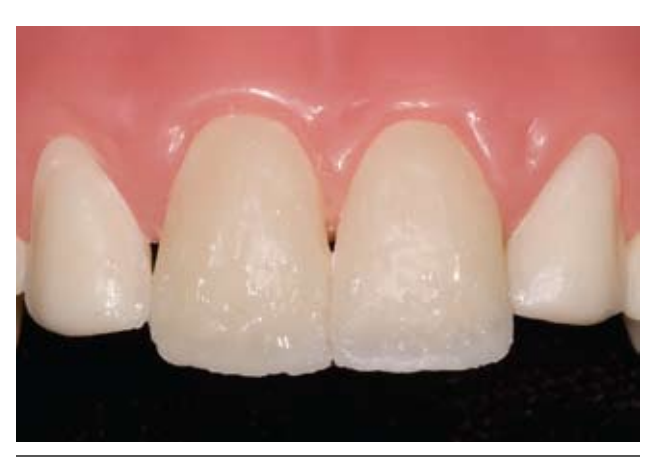
Figure 11: Iridescent Blue composite was applied to tooth #8 primarily between the previously formed dentinal lobes to create incisal translucency.