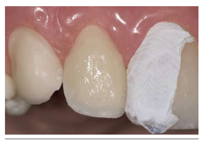
Figure 17: Iridescent Blue composite was applied to tooth #7 to create incisal translucency.