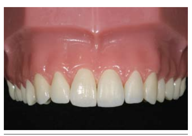
Figure 31: Using rubber points, cups and wheels, a disc system, and a silicone impregnated brush, clinicians can attain a luster and polish appropriate for individual cases.