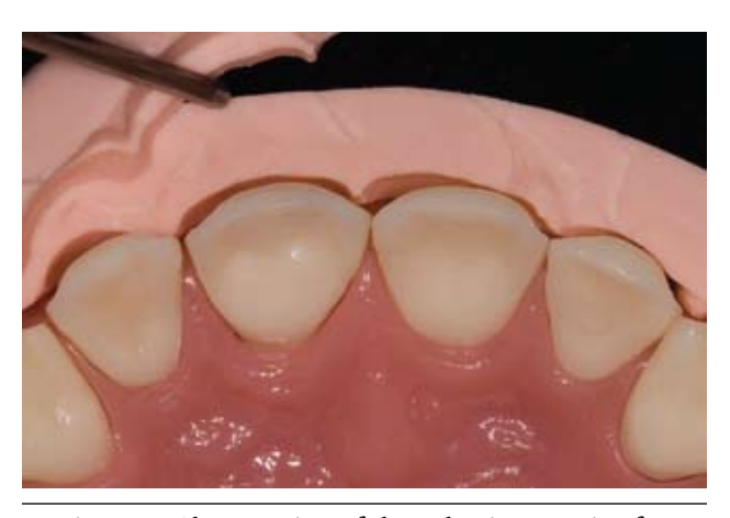
Figure 7: Close-up view of the reduction matrix after preparation confirms that the desired reduction was achieved.