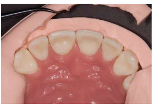
Figure 6: Incisal view of the reduction guide that will be used to confirm appropriate and uniform reduction and appropriate and harmonious contours in the final restorations.