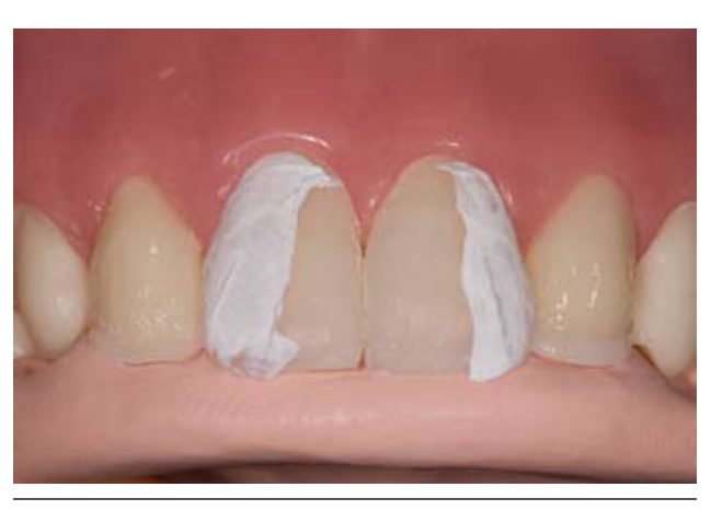
Figure 16: The remaining lingual contour and incisal plane of teeth #7 and #10 was recreated by applying Opaque Snow composite.

first, followed by the lateral incisors, then the canines. That being said, when the central incisors have been developed to approximately 80% to 90% of full contour, they should be assessed in terms of width and length symmetry, line angles, and harmonious balance (Fig 14). Calipers can facilitate this process. Once harmony and balance are confirmed, the restorative layering process can proceed to the lateral incisors (Figs 15-19). Similarly, when those restorations have reached approximately 80% to 90% of their full contour, they too should be assessed (Fig 20). Finally, the cuspids can