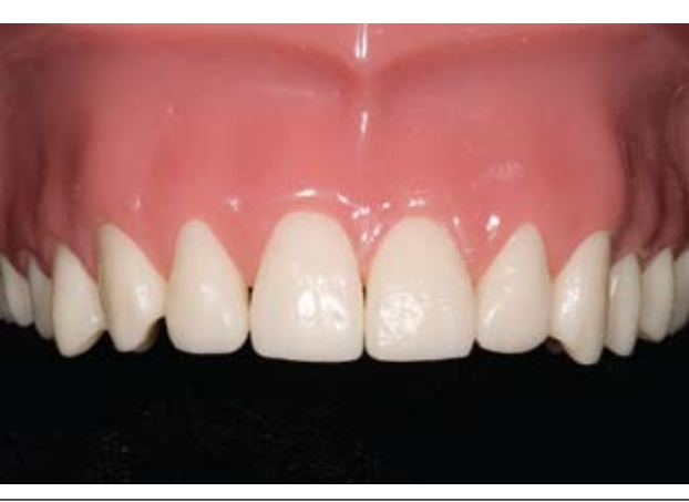
Figure 2: Preoperative view of a typodont model. In a clinical scenario, a diagnostic mock-up would be analyzed to plan the case.

The build-up or layering technique itself is one reflective of ceramist's principles. These use materials to interplay with light and recreate the hues, chromas, and values of color inherent to the tooth structure being replaced.2 The direct composite build-up steps represent a process for completing a layered restoration similar to one fabricated with ceramic to replace dentin, enamel, dentin lobes, and characteristic colors. Mastery of these techniques forms the basic foundation for creating lifelike restorations, the quality of which is limited only by the imagination.