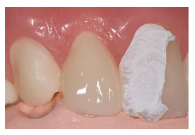
Figure 19: The final enamel layer of teeth #7 and #10 was applied in composite shade Pearl Frost.