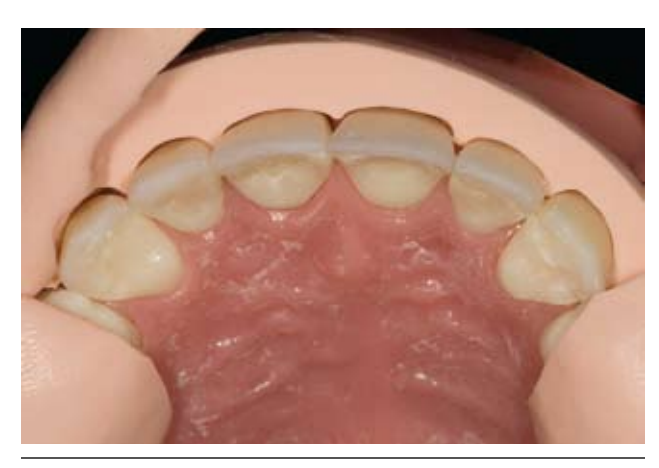
Figure 28: Incisal view of the polyvinyl siloxane matrix. Note the proximity of the matrix and the facial contour of the final restorations in the gingival half.