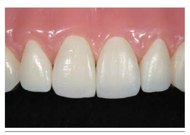
Figure 33: Use goat hair brushes and chamois wheels with wet and dry composite polishing paste; as seen on the right side of the typodont, a high polish is attainable.