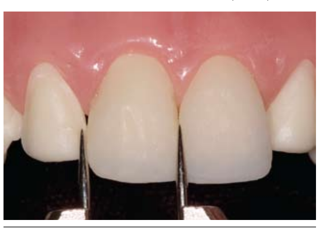
Figure 14: Calipers were used to measure the widths of the newly fabricated restorations in three areas—gingival, middle, and incisal—to ensure harmony and balance.