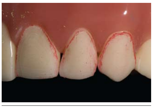
Figure 4: When minimal color change or contour change is needed, a less invasive or aggressive preparation is appropriate for Case Type V restorations.

the tooth itself (Fig 1), should be developed. Essentially, the restoration first must be created in the mind before it can be created in the patient's mouth. Diagnostic study models (Fig 2) and mock-ups facilitate understanding of how much material will be needed and how much enhancement or augmentation to the tooth structure will be required. Their use also enables clinicians to understand the contours of the teeth.