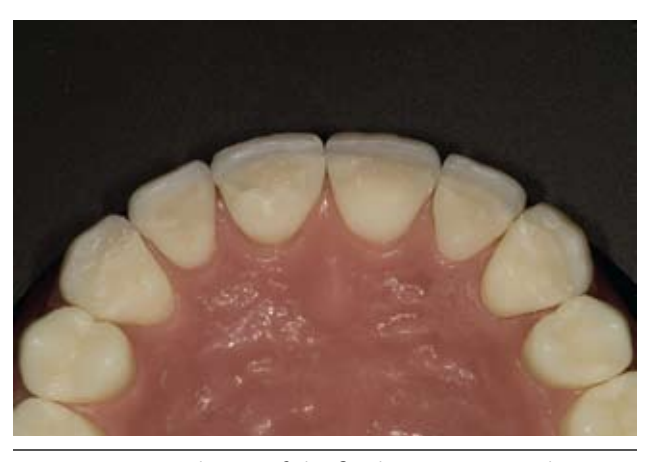
Figure 30: Incisal view of the final restorations. Clinicians should see well-demarcated line angles and a similar amount of facial surfaces and anatomy on contralateral restorations.

dentin and enamel in different parts of the tooth; and how to vary the hue, chroma, and value of the composite restorations that are systematically layered. The keys to success are observation and strategic control, and careful selection and manipulation of the desired composite material. Additionally, on an AACD Accreditation Case Type V, it is essential to use a comprehensive restorative system that provides all the requisite shade opacities, translucencies, and dentin and enamel colors and tints (e.g., Vitalescence; Premise, Kerr [Orange, CA]; 4 Seasons, Ivo-