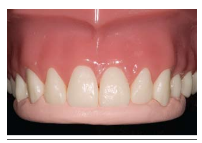
Figure 5: A PVS matrix must include the facial-incisal line angle to aid in the fabrication of the designed incisal edge plane and contour.