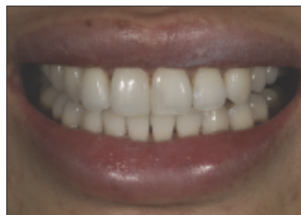
Figure 5. Upon completion of orthodontic treatment, the patient was still unhappy with the appearance of tooth No. 6, which had less buccal reveal than tooth No. 11. At this time in treatment, a direct composite veneer had been placed on tooth No. 8.

enabled dentists to provide patients with restorations that are exceptionally strong and demonstrate the durability required to withstand mastication forces. 10,11