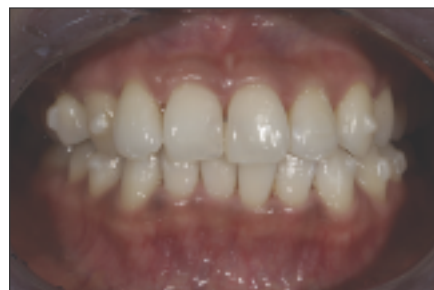
Figure 4. After phase 1 of Invisalign treatment, another series of photographs were taken to submit for Invisalign refinement submission.