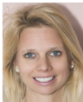
Actual Non-Simulated After Photo

The above picture(s) are a simulation of the potential outcome of cosmetic dental procedures, your