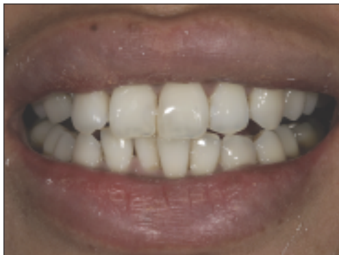
Figure 1. Prior to orthodontic treatment, the patient presented with unaesthetic dentition that demonstrated crowding, rotations, overlapping, and lingualized tooth No. 6, which lacked proper buccal reveal.

In addition to these advantageous characteristics, composite restorations are minimally invasive and allow greater preservation of sound tooth structure. 1-3 Although required in some indications, aggressive