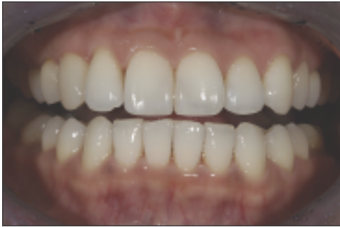
Figure 10. A retracted view of the cutback Venus Diamond composite layered veneer that was fabricated using CEREC technology and a Z100 composite computer-aided design and manufacturer block.