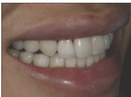
Figure 6. Right side smile view of the patient after Invisalign.

Scanning powder (Opti-Spray [Sirona Dental Systems]) was then sprayed on the mock-up of tooth No. 6 on the model. Utilizing a CAD/CAM system (CEREC), the mock-up of tooth No. 6 was left on the model and scanned. To capture the no preparation tooth form, the mock-up was removed from the model and scanning powder was applied. Once the tooth form had been scanned, the CEREC software was placed in correlation mode, and the restoration was fully designed and milled from a CAD/CAM composite block (Z100) (Figure 8).