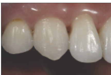
Figure 7. Tooth No. 6 underwent minimal preparation with a coarse diamond bur to remove aprismatic enamel.