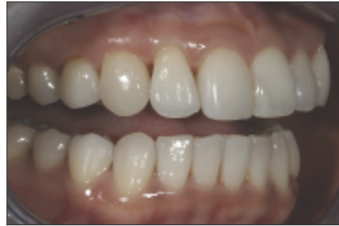
Figure 11. The retracted right side view of the completed restoration, which demonstrated ideal coloring, outline form, and texture in alignment with the natural dentition.

the proper outline form was established with the A1 composite (Venus Diamond), the restoration was compared to the structure of the tooth No. 11 from the VPS impression. To create reasonable symmetry with tooth No. 11, the contour of the mesial-transition line angle should mirror No. 11, while other outline forms, including the incisal edge and the incisal plane, should demonstrate variety. After deeming the contour satisfactory, this layer of composite was light-cured.