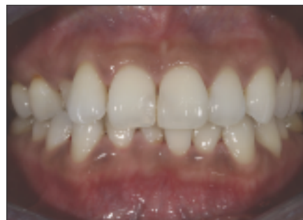
Figure 2. A retracted view of the patient's dentition prior to orthodontic treatment with aligner trays (Invisalign [Align Technology]).

CAD/CAM technologies, like the CEREC AC system (Sirona Dental Systems), 9,10 Increasing predictability, CAD/CAM technologies have