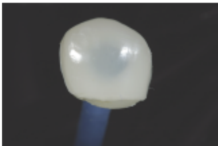
Figure 9. The composite layered veneer demonstrated high polish on the jig.